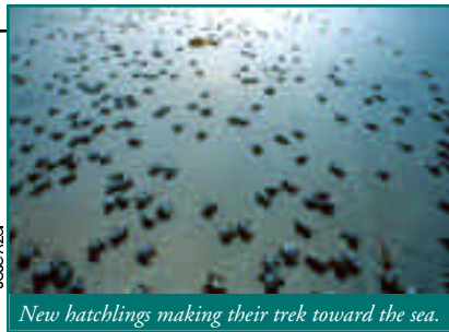
New hatchlings making their trek toward the sea.

Sea turtles are marine reptiles that have existed since their giant land turtle ancestors returned to the sea sometime during the Age of Dinosaurs. Scientific study places sea turtles back in time as far as 150 million years ago.