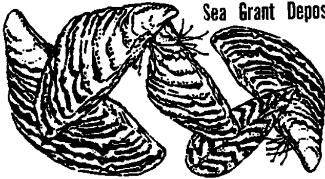
Larger than actual size.

Zebra mussels are freshwater mollusks which were accidentally transported from Europe to North America in the mid 1980s. First discovered in Lake St. Clair in June 1988, the mussels quickly spread to Lakes Erie and Ontario and the St. Lawrence River. Since then, they have spread to all of the Great Lakes and a growing number of U.S. and Canadian inland waterways. They are expected to spread to the majority of the U.S. within a decade. The D-shaped, light-and-dark-banded zebra mussels are not the first non-native species to enter the Great Lakes. At present some 136 non-native species have been accidentally or purposely introduced into the Great Lakes.