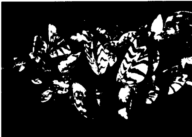
Zebra mussels can attach to almost any hard surface, such as plastic, metal, concrete or the wooden dowel pictured above.