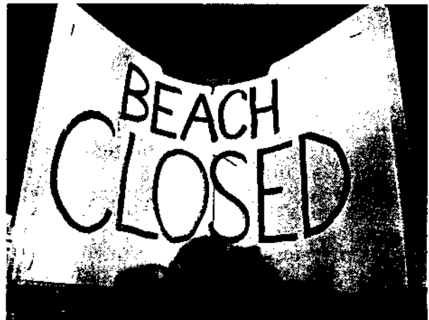
Red tides sometimes prompt public beach closings by cautious officials.

On the positive side, sport fishing may be bolstered immediately following red tide. Fishermen report more and bigger catches after red tide outbreaks.