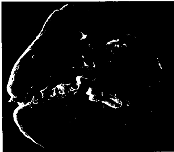
Ptychodiscus brevis enlarged 4600 times.

Red tides occur occasionally throughout the world, in some places more often than in others. In Texas, major outbreaks, though rare, are similar to the phenomena elsewhere. Major outbreaks in Texas have been caused by two species: Ptychodiscus brevis and Gonyaulax monilata .