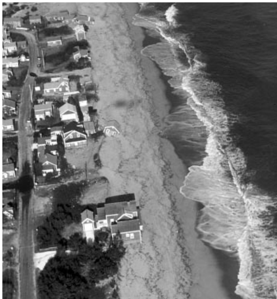
Figure 1. Codfish Park area along the eastern shore of Nantucket.

historic shorelines on an approximate lot-by-lot basis (every 40 meters or 128 feet), for a total of 30,354 transects. The distance between each of the five historic shorelines was measured at each transect